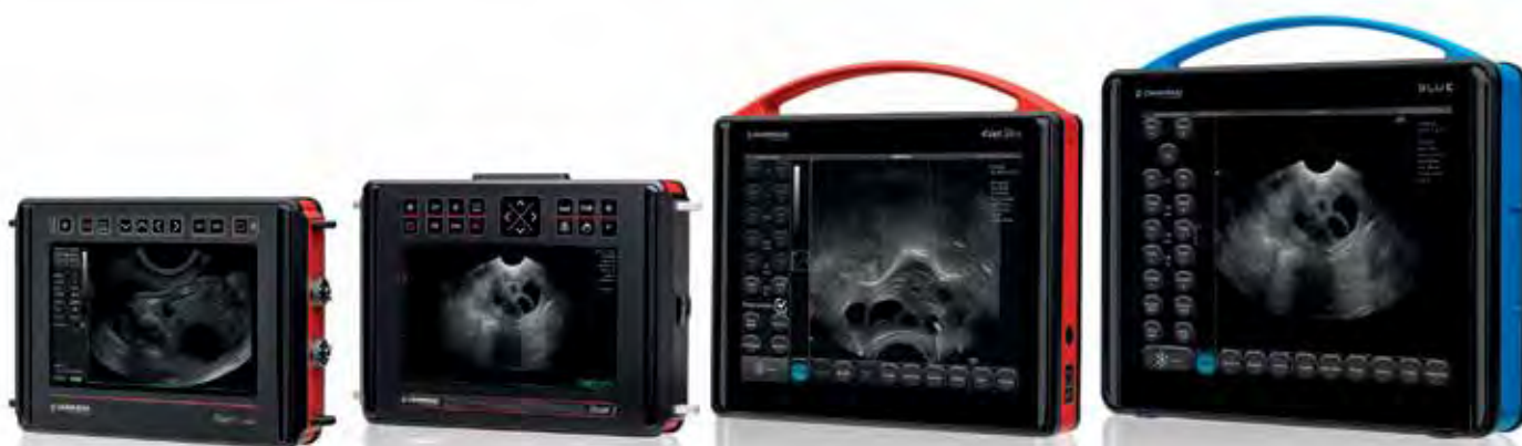
iScan 2 MULTI